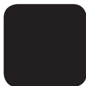
NOIR RAL 9005