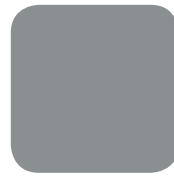
GRIS GALET RAL 7045