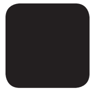
NOIR RAL 9005