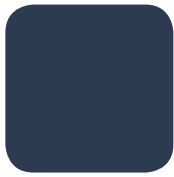
BLEU HOGGAR RAL 5003