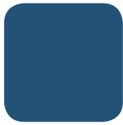
BLEU BRETAGNE RAL 5010